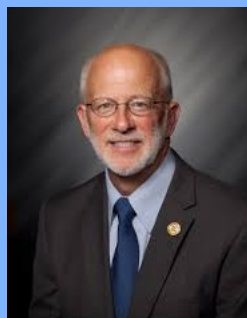
Rep. Greg Beumer

Senator Holdman and Representative Beumer will discuss legislation before the General Assembly and answer your questions.